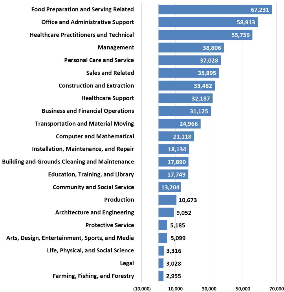
2016 - 2026 Total Numeric Change

In Balance of Maricopa, 21 of the 22 major occupation groups are projected to record gains over the ten-year period. Food Preparation and Serving Related Occupations are projected to record the largest numeric change with 34,057 jobs (2.9% annualized growth).