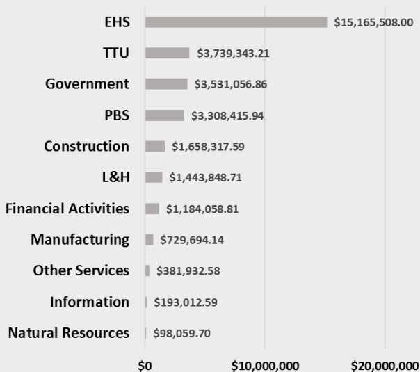
Value of Rule Improvements and Rule Eliminations from CY2018 by Supersector

The monetized economic impact refers to the costs to businesses simply due to the existence of these outdated or obsolete rules within the Arizona Administrative Code (AAC). These rules may have become obsolete due to timeliness or even lack of statutory authority. The estimates for lost economic activity quantify how much productivity businesses lose because a worker must sift through these rules even though they are invalid. This could mean reading an outdated rule, consulting the Arizona Revised Statutes (ARS) for statutory authority, or even possibly making a business decision based on a rule that lacks validity. Since these rules do not increase societal welfare, there is no loss in benefits. These estimates are focusing on a very narrow and conservative estimate of how businesses can be impacted by outdated rules.